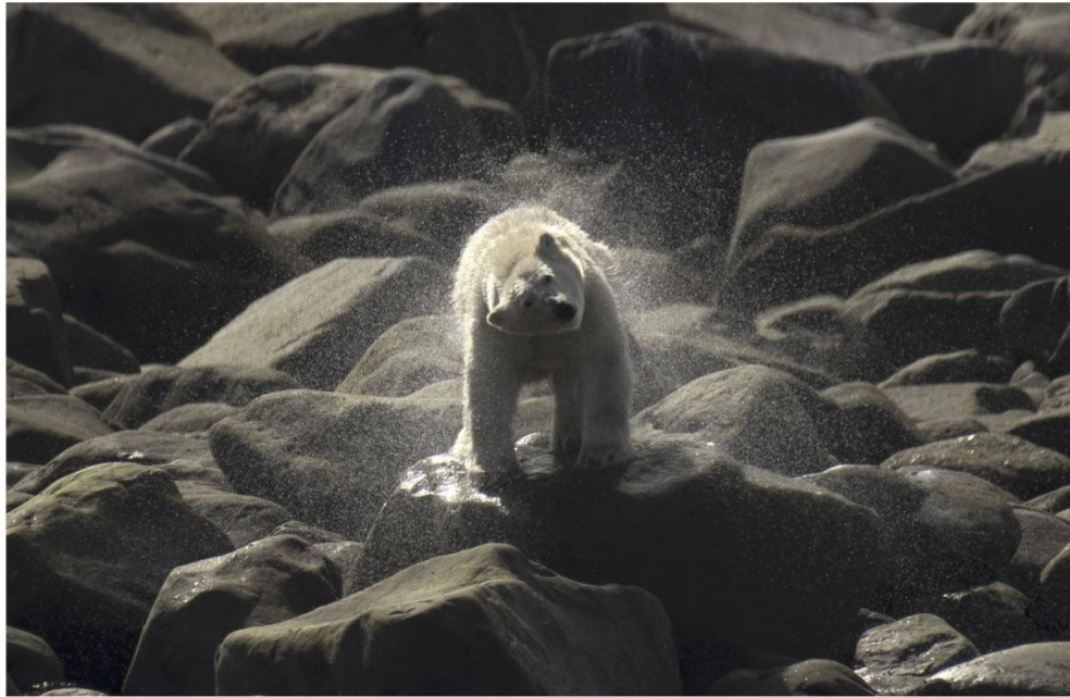
Investors just want to shake off this bear market. Patience, says Goldman.

Critical information for the U.S. trading day